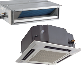
Cassette Indoor Unit<sup>2</sup>